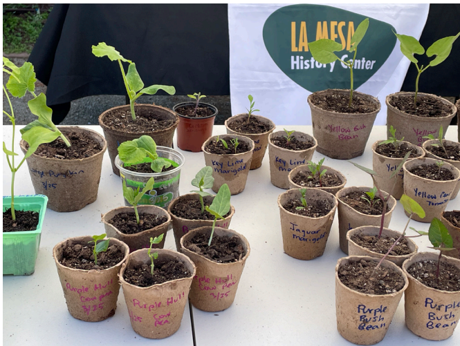
Volunteers made it possible for the LMHC to participate in the La Mesa Earth Day celebrations on April 20, 2024.